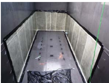
On going SolarTech VE55 application