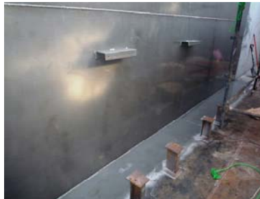
Blasted tank surface